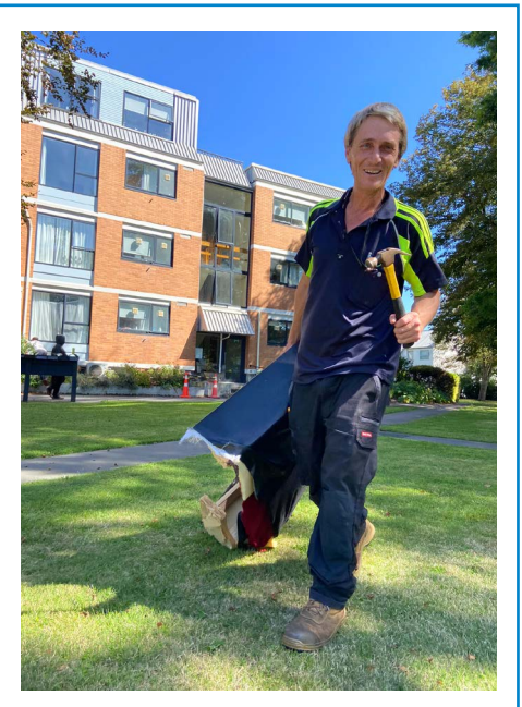
Getting cleaned up

If we're planning any work in your community, we'll send you a letter with all the details. Thanks for your support as we work in your area.