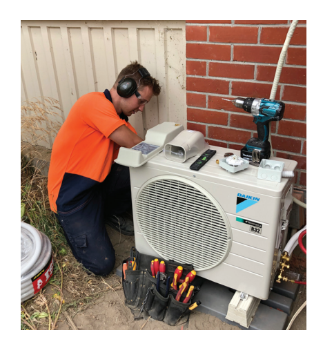
Contractors have started work on the scoping and installation of heat pumps at Glue Place.

If you have any queries about the process, please get in touch with your Tenancy Manager.