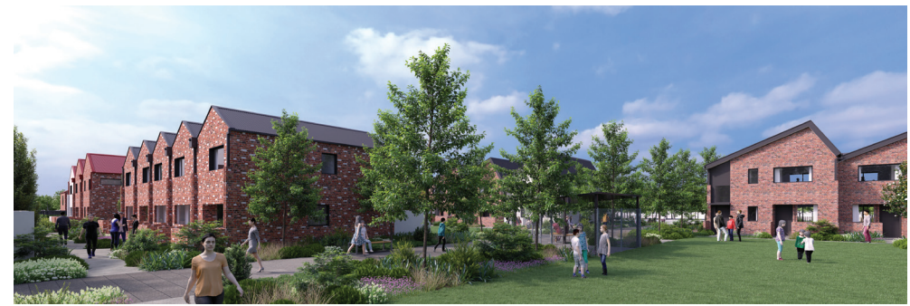
Brougham Street Development - Opening Early 2021