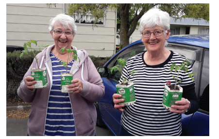
Happy tomato plant recipients

OCHT will review applications in January 2020 and will be in contact with applicants following the review process.