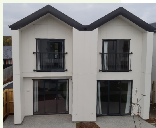
Lesley Keast Place Complex